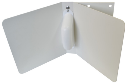
SCR12-2400 Large Corner