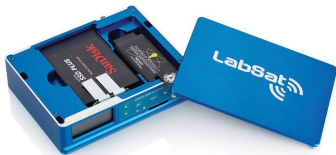
LabSat 3 Wideband - Greatly increases GNSS Record and Replay capabilities

Up to 56MHz recording bandwidth at 1, 2 or 3 bit allows for the capture of a very wide range of live-sky satellite signals: