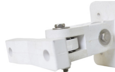
Adjustable Wall Mount Bracket