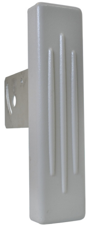
PS Series Sector Antenna