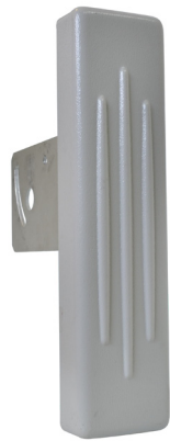
PS Series Sector Antenna