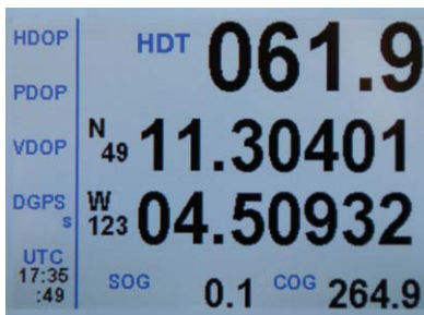
Vessel Position and Heading

The Navigator G2 displays valuable information with a touch of a button!